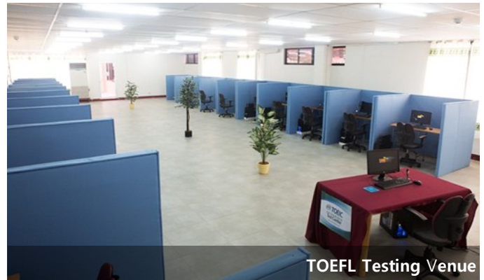
TOEFL Testing Venue